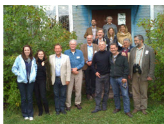
Delegates at the IUCN Pan-Europe meeting at Nizhne-Svirskiy State Nature Reserve

The IUCN Pan-Europe Meeting of Regional Councillors and National Committee Chairs met at the Nizhne-Svirskiy State Nature Reserve on Europe’s largest lake, Lake Ladoga near St. Petersburg in the Russian Federation, between 20 and 23rd September 2010.